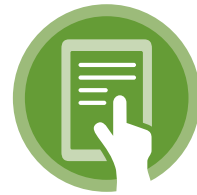
Learning Management System