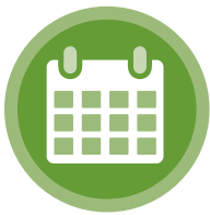
Meetings & Events Module