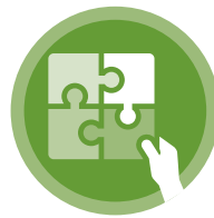
Reports & Investigations