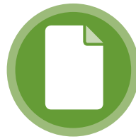
Anything Forms Module