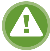
Pre-Work Hazard Assessments